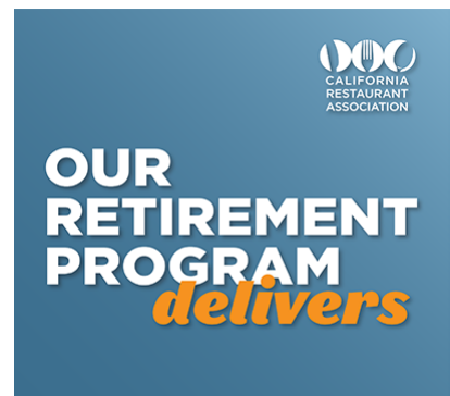
THE BEST 401(K)