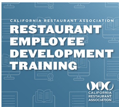
THE CRA'S NEW EMPLOYEE