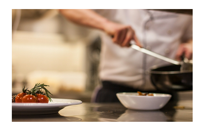
Restaurant owner on business loss due to coronavirus pandemic

It is March 18, 2020, and this is what you need to know: <u>California restaurant dining rooms</u> <u>are closed, per a directive from Gov. Gavin Newsom, which you can read more about</u> <u>here</u>. In many counties and cities, there are now orders to shelter-in-place, with the understanding that people may leave their homes for essential tasks, like buying food. Drivethru, delivery, and takeout orders are still allowed. The CRA is urging public officials to continue allowing restaurant kitchens to remain open and serve food – the need for meals continues and has grown in households with children home from school.