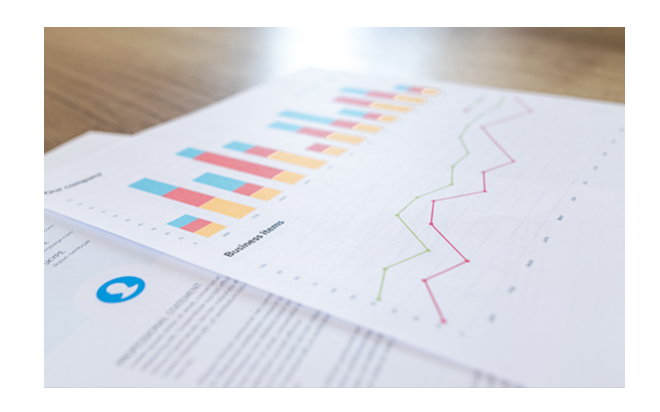
The top 5 restaurant digital marketing trends in 2020