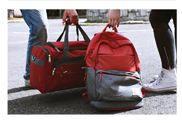
Partner Content: Sound The Alarm: What California's Latest Bag Check Case