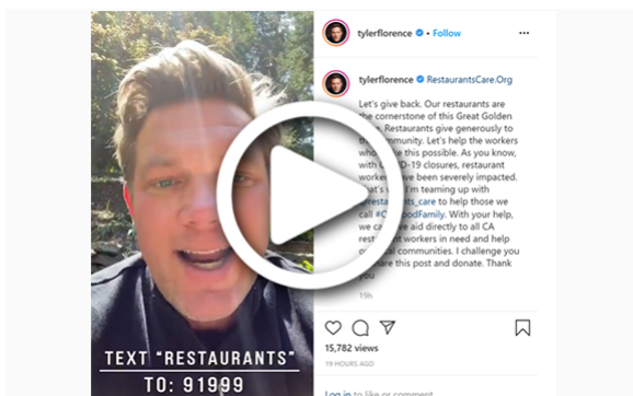
Tyler Florence rallies for restaurant workers