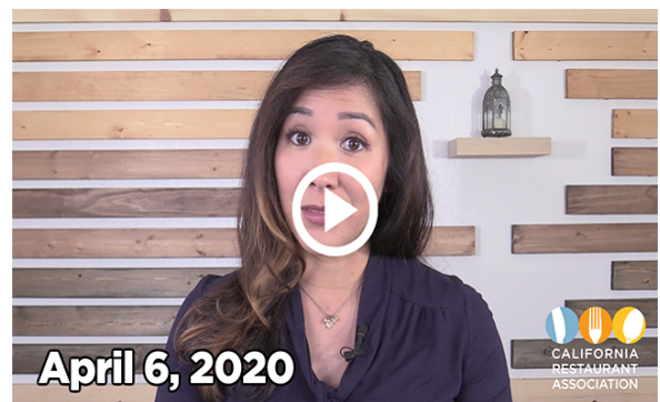
News You Need to Know: CRA fights for grocery sales at restaurants