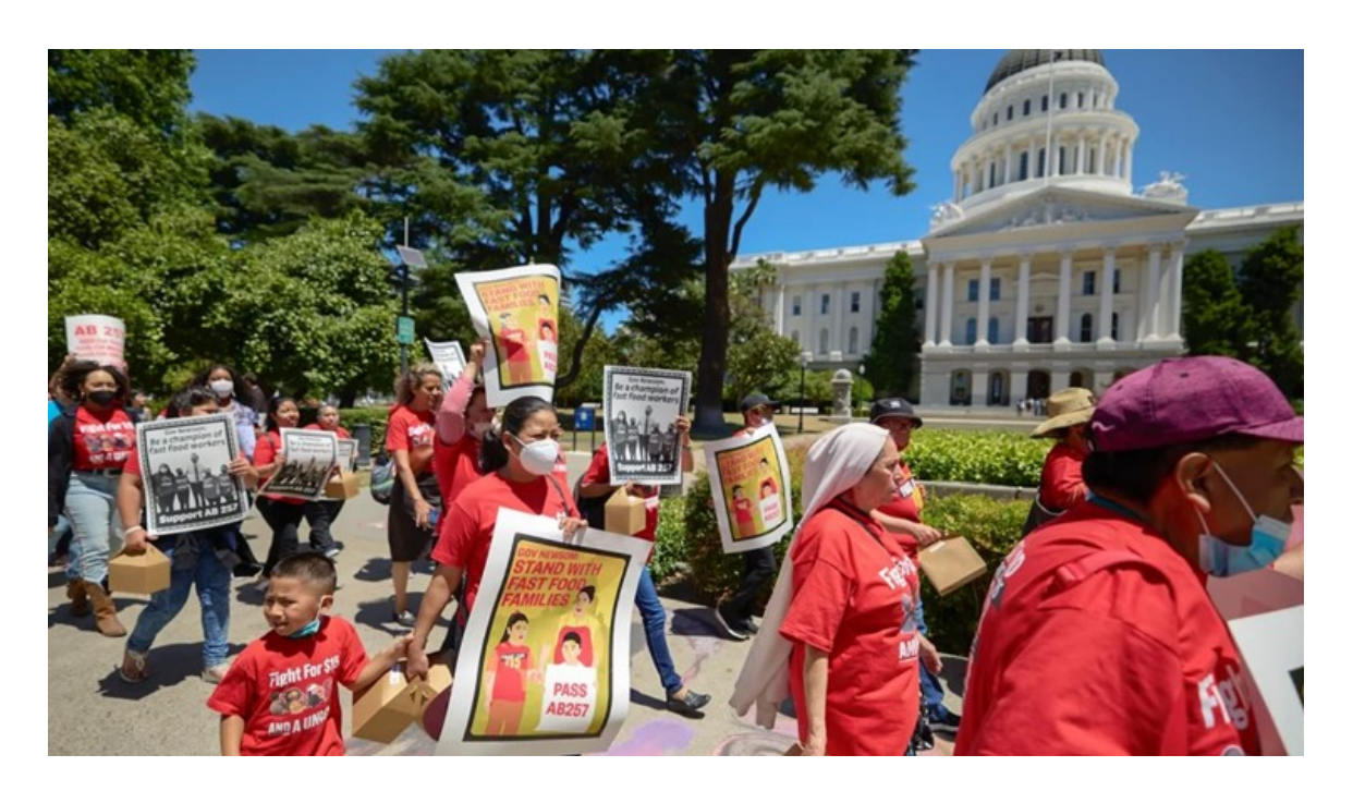
California makes a ham-handed attempt to regulate

The mission of the California Restaurant Association is to be the definitive voice of the California foodservice industry.