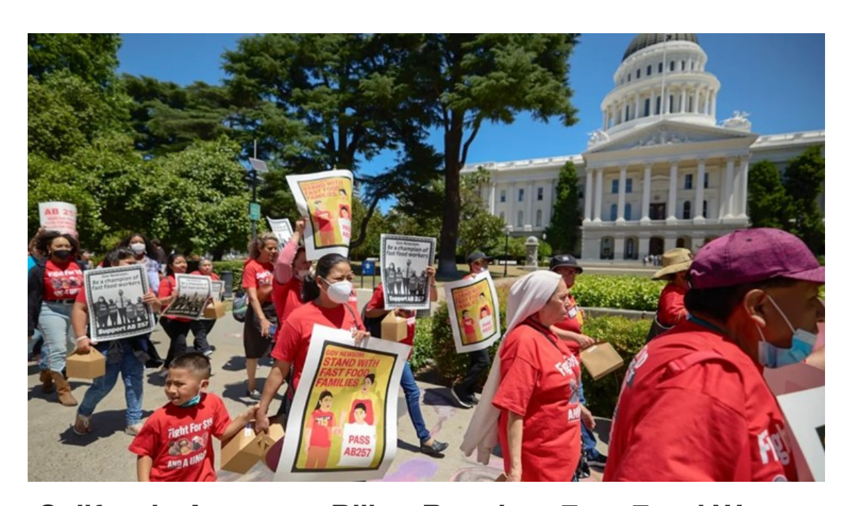
California Approves Bill to Regulate Fast Food Wages

The mission of the California Restaurant Association is to be the definitive voice of the California foodservice industry.