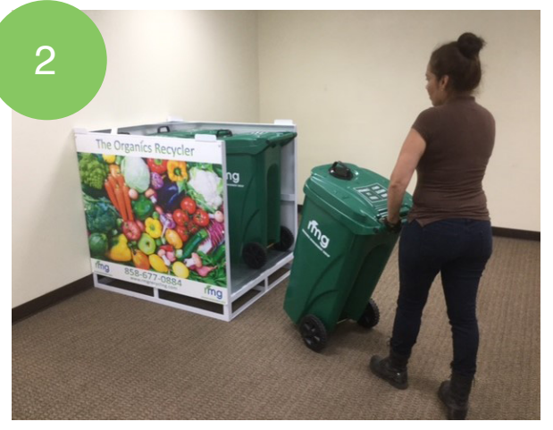
Customers wheel one tote to work station at a time.