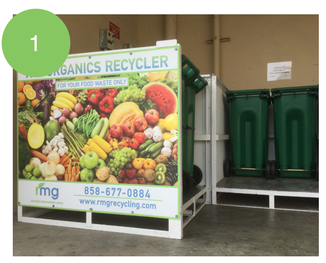
Each pod contains 4 (32 gal) totes.