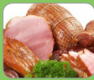
Boneless cooked meats