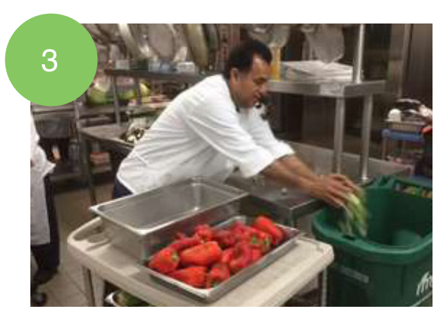
Totes are filled with food waste and swapped out as needed.