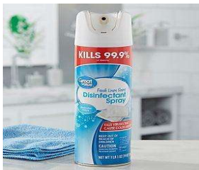
Disinfectant Spray CE/FDA UPON REQUEST