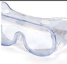
PROTECTIVE EYEWARE CE/FDA UPON REQUEST