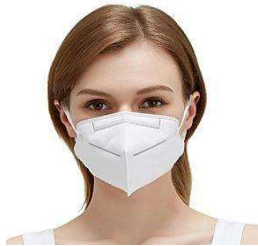
KN95 MASK FDA/CE UPON REQUEST