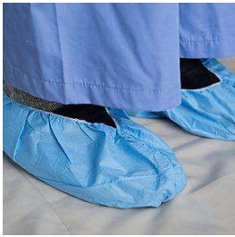
Non-woven shoe cover CE/FDA UPON REQUEST