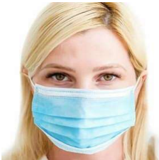
DISPOSABLE FACE MASK CE/FDA UPON REQUEST