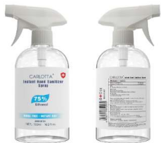
HAND SANITIZER SPRAY 500 ML AND 1