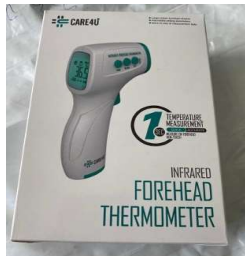
INFRARED FOREHEAD Infrared Forehead Thermometer CE/ FDA UPON REQUEST