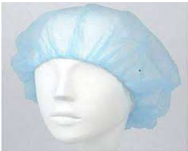
Heat cover CE/FDA UPON REQUEST